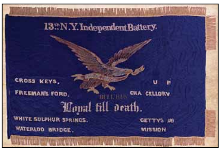
The flag of the 13th N.Y. Independent Battery which is included in the exhibit and from which the tour take's its name.

Between now and May of 2014 there will be a special 1863: Loyal till Death: A Civil War Tour at the New York State Capitol every Thursday from 5:30 to 6:30 p.m. The tour will begin at the State Street Lobby of the Capitol and will explore the importance and symbolism of regimental flags on display there. The flags are from the New York State Battle Flag Collection, administered by the New York State Military Museum in Saratoga Springs New York. After years of being poorly stored each flag was conserved by the NYS Office of Parks, Recreation and Historic Preservation in partnership with the Military Museum. If you are interested, register for a tour on-line at www.ogs.ny.gov or call 518-473-7582.