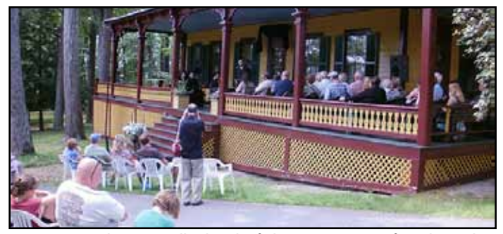
Grant's son speaks emotionally about his father to event visitors from the porch where the General died on July 23, 1885.