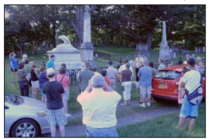
A late afternoon cemetery tour gathers to hear about General Thomas' grave site.