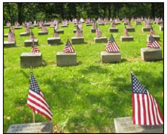
View of Soldiers & Sailors' Plot at Oakwood Cemetery Troy, NY.