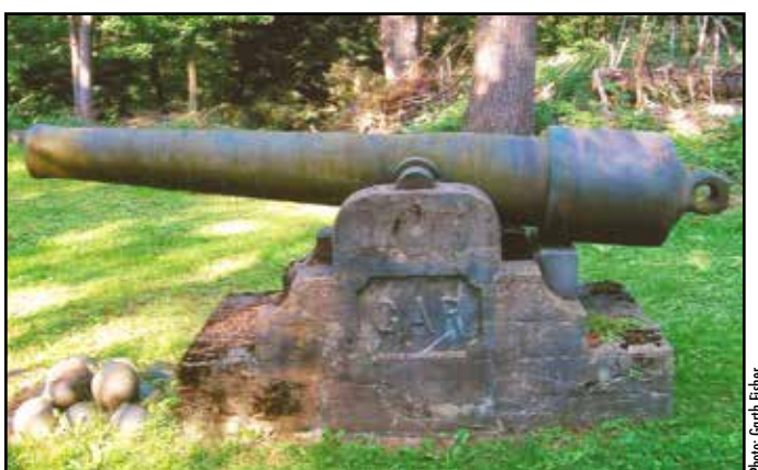
GAR Post 57 created this monument in Evergreen Cemetery outside of Fonda, NY.