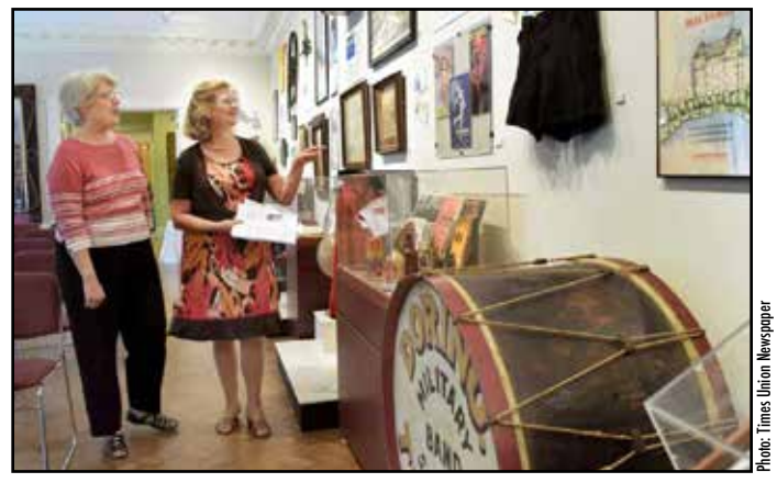
Celebrating Troy: 200 x 200 exhibit at the Rensselaer County Historical Society.

The "official" public opening of Celebrating Troy: 200 X 200 took place on September's Troy Night Out, Friday, September 30th from 5-8 p.m. The exhibit tells the city's two-centuries-old story. The Rensselaer County Historical Society is so appreciative of the local generosity in lending Troy objects to the show. Among items on display in the exhibit is the USS Monitor poster for which the Col. George L. Willard Camp #154 helped obtain grant funding to produce. Copies of the poster will be given away to visitors. The exhibit will be open, Thursday through Saturday from noon to 5 PM, until December 17th.