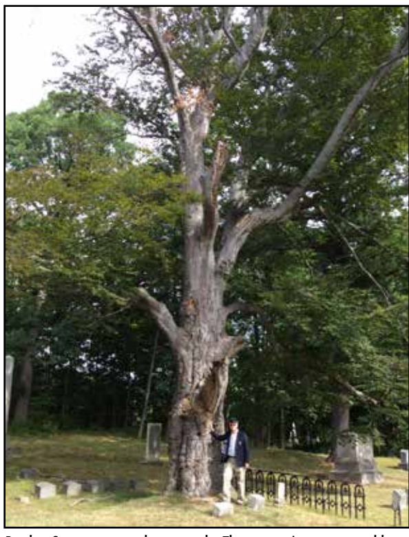
Brother Swartwout stands next to the Thomas site's greatest problem.