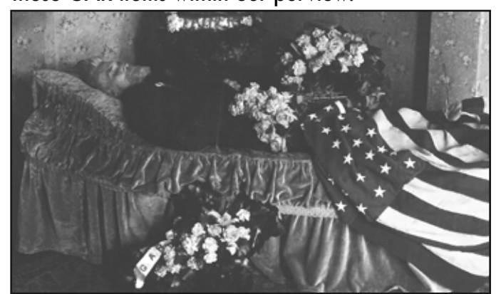
A member of the GAR at his funeral from a recovered glass negative.

It was just sitting there, on a stone wall, in a small araveyard on NY Route 28 just north of Weavertown, NY. The GAR marker didn't seem to belong to any grave in the area. In our travels and our everyday experiences we can be confronted by a reminder of the GAR at any moment. The funeral photo below was found in a group of glass photographic negatives at a flea market in the southern tier of NY State. We may not know the origin of the item but it does make us remember our departed Brothers. There are many GAR monuments across the country in a variety of conditions. The one shown in the bottom right photograph is in a cemetery near Johnstown, NY and it shows wear but is still in decent repair. As we have these experiences we should make note of them and mark them down for future consideration. The canon and its base in Johnstown is going to need repair at some point and we should keep an eye on these GAR items within our purview.